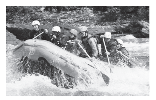
Brothers enjoy some whitewater rafting during a team-building trip to West Virginia this fall.

This past summer, several officers headed to New Orleans for the annual leadership conference. Several brothers also took on summer internships in the U.S. and abroad.